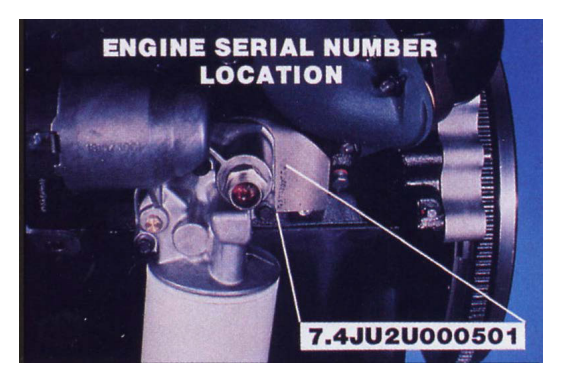
7.3 L DIT – Left Rear Oil Cooler Base

Many applications in the Alliant Power Application Guide list engine serial numbers. The photos below show engine serial number locations for 7.3L Power Stroke<sup>®</sup>, 6.0L Power Stroke and I-6 engines.