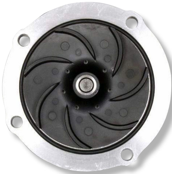
Previous Design Impeller