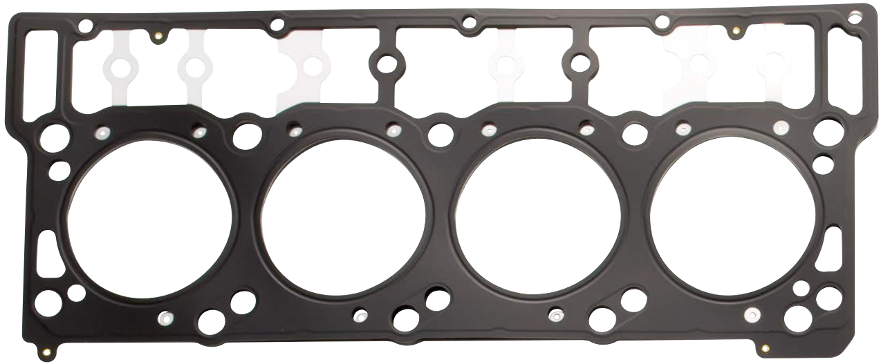
Early Head Gasket Design

The two head gasket designs are shown below for visual reference.